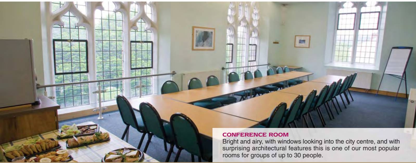
CONFERENCE ROOM Bright and airy, with windows looking into the city centre, and with surprising architectural features this is one of our most popular rooms for groups of up to 30 people.

St Mary's is a modern, professional Conference venue within a historic and impressive Victorian church.