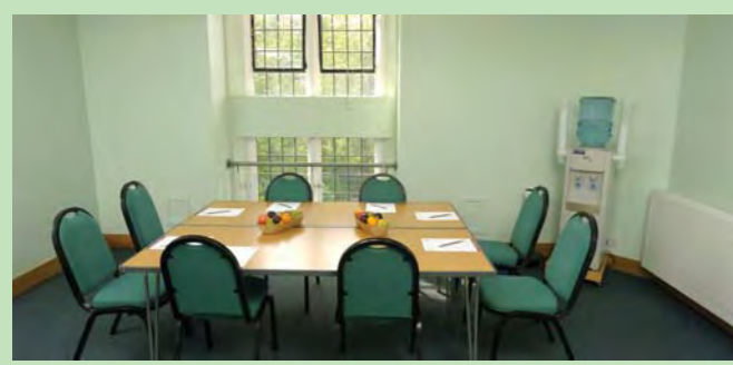
MEZZANINE/PARISH ROOMS Smaller rooms, ideal for meetings of up to 12 people, or perfect for breakout space.