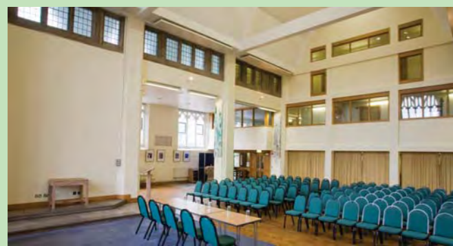
NAVE The combination of the arched window and ornate columns with the simplicity of the woodwork gives the Nave a contemporary and relaxed feel with fantastic natural light. The Nave is ideal for larger events.

Here are a few of our rooms... but you can see the rest of them by visiting our website at www.stmarys-church.co.uk .